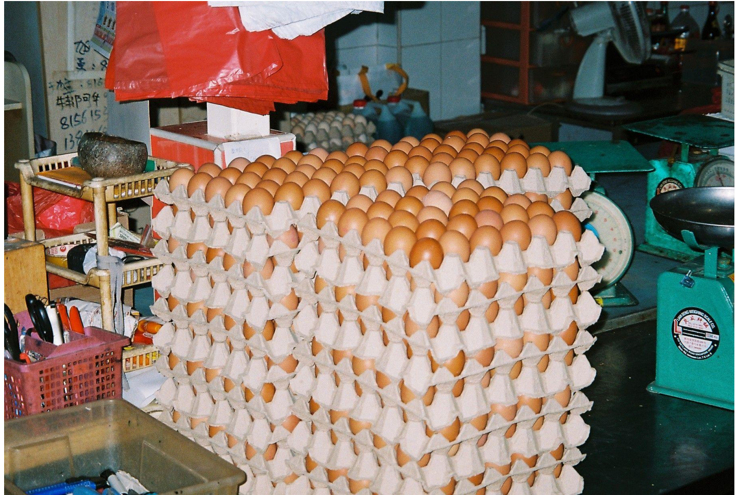
$75.00 Untitled (EGG no.79)