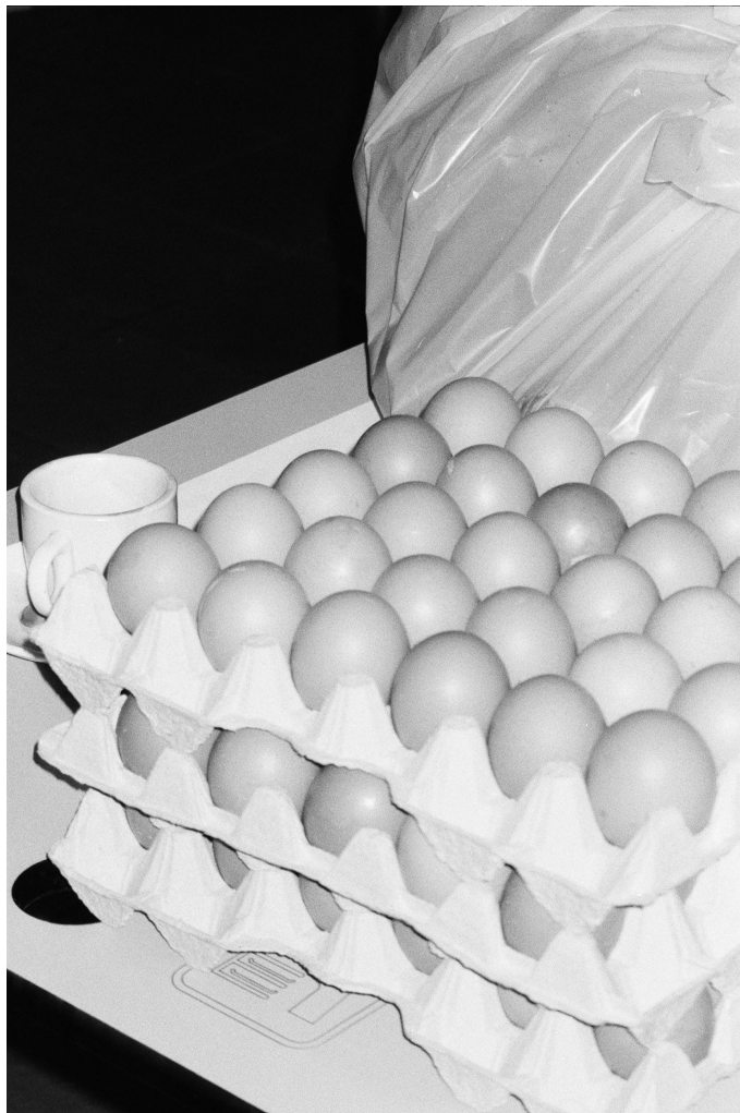
$75.00 Untitled (EGG no.14)