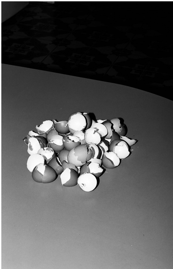
$75.00 Untitled (EGG no.105)