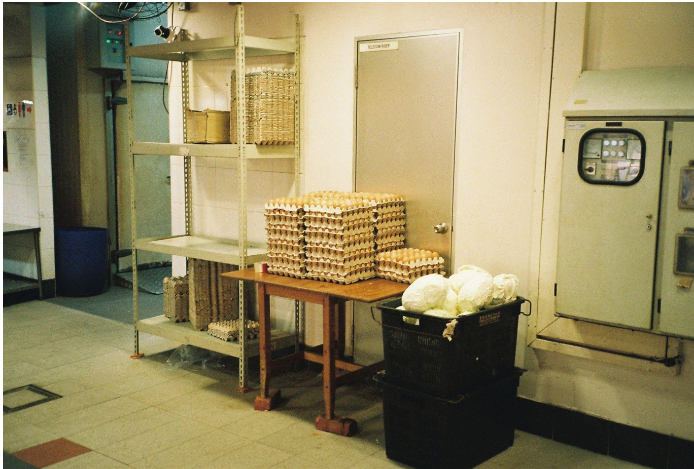
$75.00 Untitled (EGG no.81)