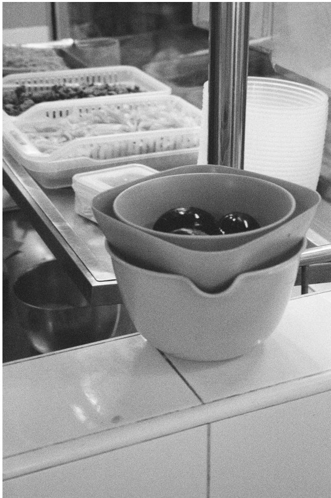
$75.00 Untitled (EGG no.41)