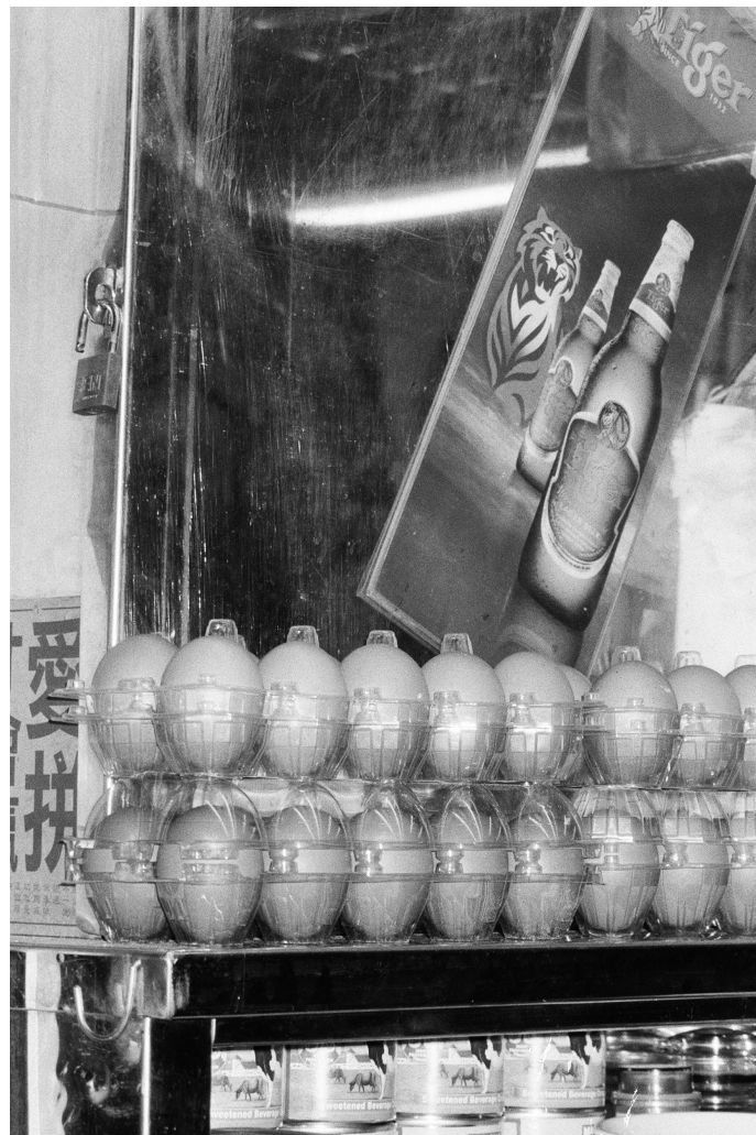
$75.00 Untitled (EGG no.12)