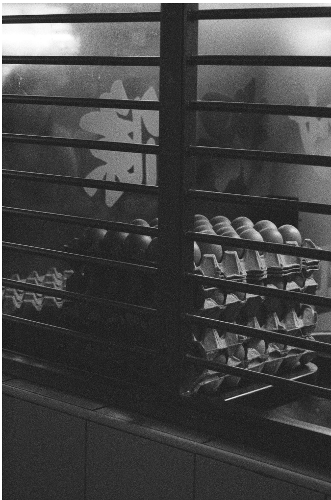
$75.00 Untitled (EGG no.37)