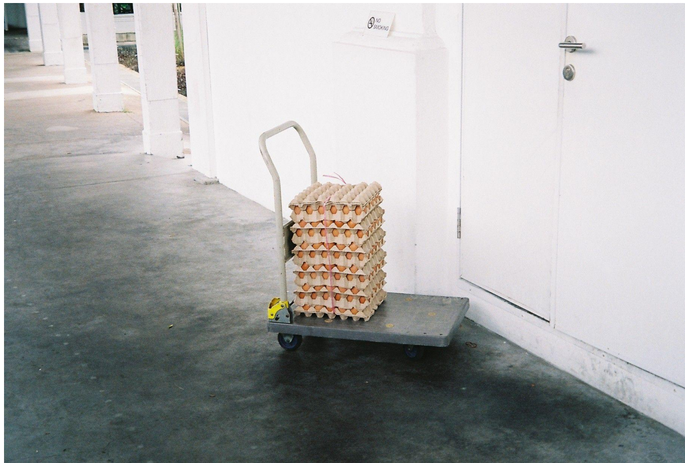
$75.00 Untitled (EGG no.46)